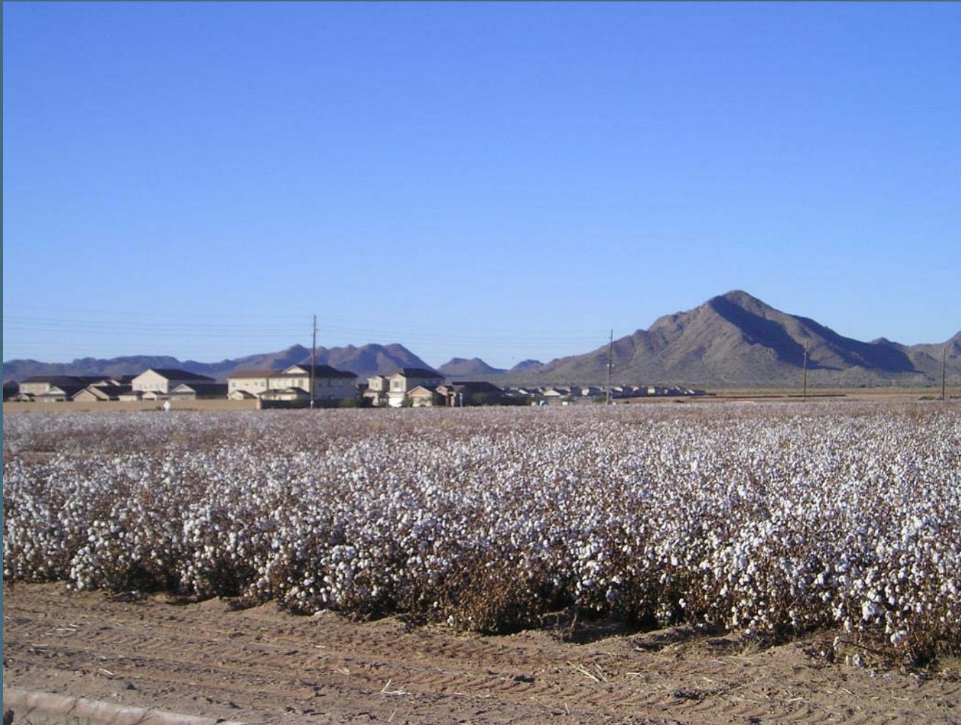
North–South Corridor Study